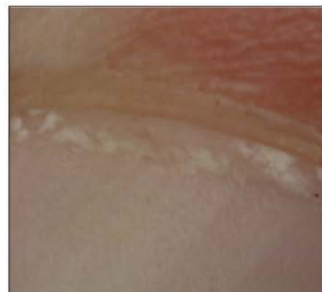
THE CUTICLE IS THE DEAD TISSUE ON THE NAIL PLATE, NOT THE LIVING TISSUE THAT SURROUNDS THE NAIL PLATE. IN THIS CROSS-SECTION THE CUTICLE CAN BE SEEN SEPARATING FROM THE UNDERSIDE OF THE EPONYCHIUM – FIGURE 1.3

Clearly, the confusion can be avoided if we teach clients about the anatomy of the natural nail. While they are marveling at your knowledge, you will be helping eliminate the confusion. And you'll be making a positive contribution to our industry.